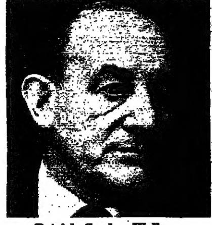
Patrick Gordon Walker

Emboldened by his old colleagues' rewriting of history, Mr. Gordon